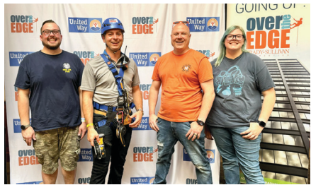
Our 2024 Over the Edge team each repelled 24 stories to raise more than $5k!